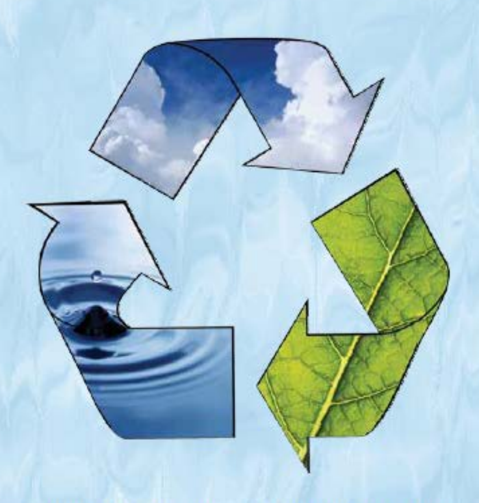
This document is printed on paper made from 100% recycled materials